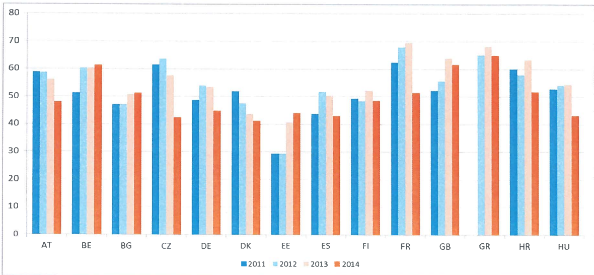
Fig.1A The evolution of the losses' values per year and country (€/MWh)